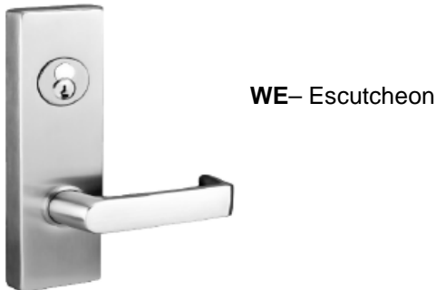
Escutcheon Dimensions 5/8"(D) x 2-5/8"(W) x 8-1/2"(L)