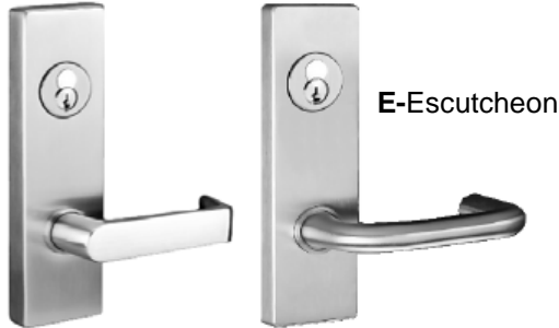
Escutcheon Dimensions 5/8"(D) x 2-1/4"(W) x 8-1/8" (L)